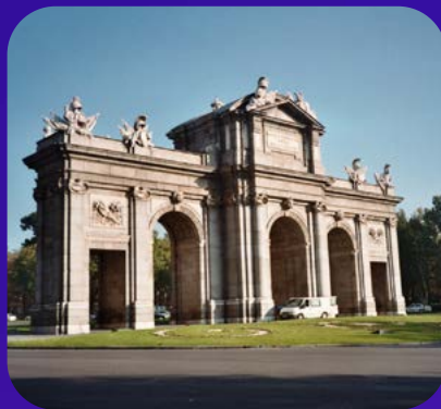
Puerta de Alcalá