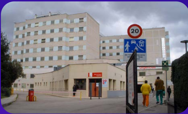
Gregorio Marañón University General Hospital C. del Dr. Esquerdo, 46, Retiro, 28007 Madrid, Spain