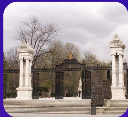
Puerta de España