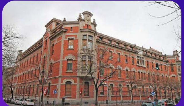
Santa Cristina University Hospital C. del Maestro Vives, 2, Salamanca, 28009 Madrid, Spain