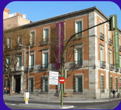
Thyssen-Bornemisza National Museum