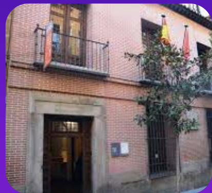
Lope de Vega House Museum