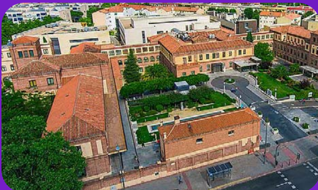
Beata María Ana Hospital C. del Dr. Esquerdo, 83, Retiro, 28007 Madrid, Spain