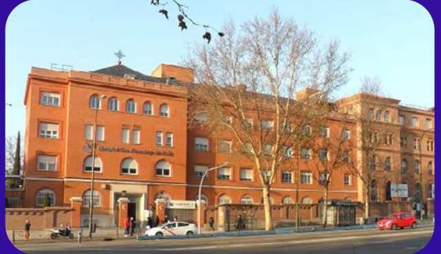
San Francisco de Asís Hospital Centro, 28013 Madrid, Spain